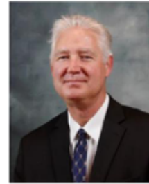
Immediate Past State Deputy

Brother State Officers, Reverend Clergy and Chairmen,