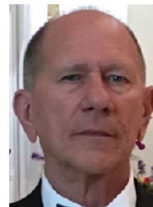
Formation Degree Team Leader

On Saturday January 23rd, Our Lady of Las Vegas and St. Jude Council #9102 will be hosting a LIVE FORMATION DEGREE - Degree of Charity, Unity and Fraternity, (1st, 2nd, and 3rd Degree).