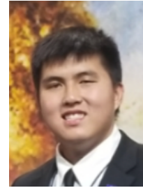
Nevada Young Adult Chairman