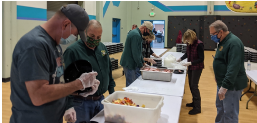
Part of the Ponderosa Council 4928 Dinner Packaging Team in Action

Many families throughout Northern Nevada had a better, much needed meal over the holidays. Those that helped make it happen experienced the joy of living out the calling of their faith.