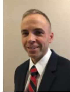
Faith in Action Program Chair

Worthy Grand Knights and Program Directors,