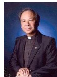
Nevada State Chaplain

We will be holding a Requiem Mass for Nevada Knights and their spouses who have passed in 2020. The Mass is scheduled for Wednesday, January 6, 2021 at Our Lady of Las Vegas at 5:00PM. It will also be available to view virtually.