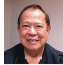
State Family Program Director