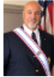
State Retention Director

Wishing you and your family a Merry Christmas and a Prosperous New Year!