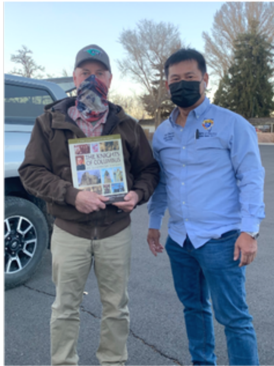
With Pope John Paul II the Great Council 6688 in Yerington, Nevada